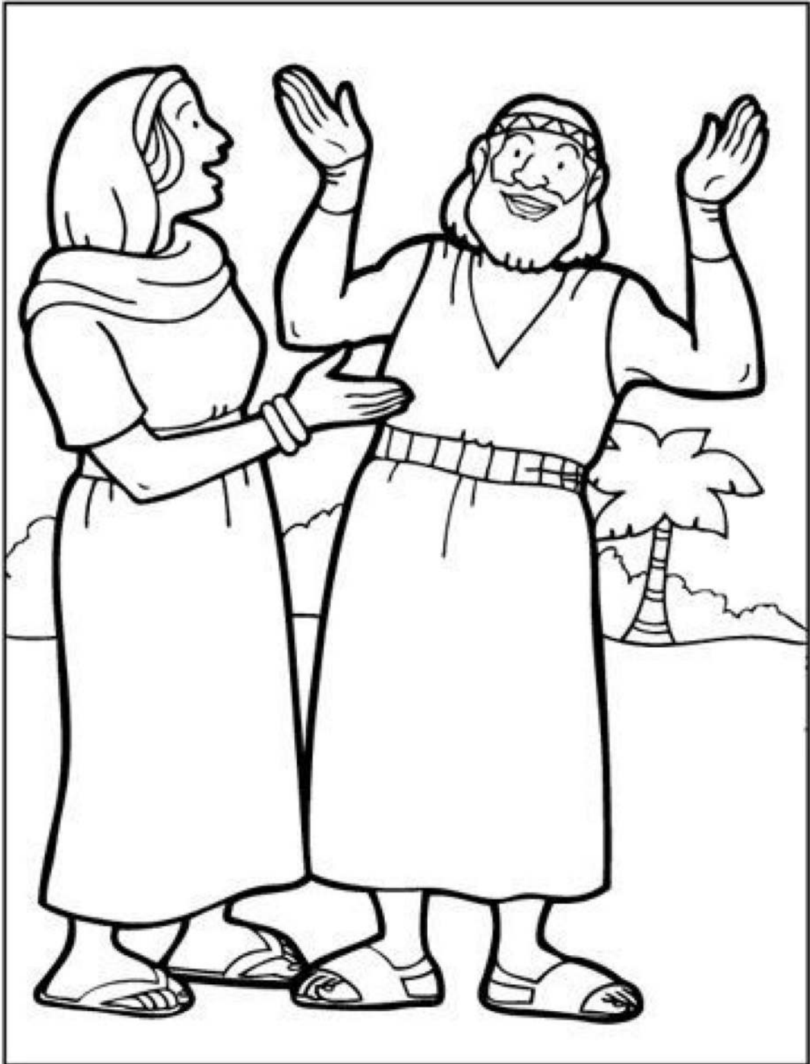
Deborah and Barak

© 1997 by Gospel Light, My Bible Coloring Book.